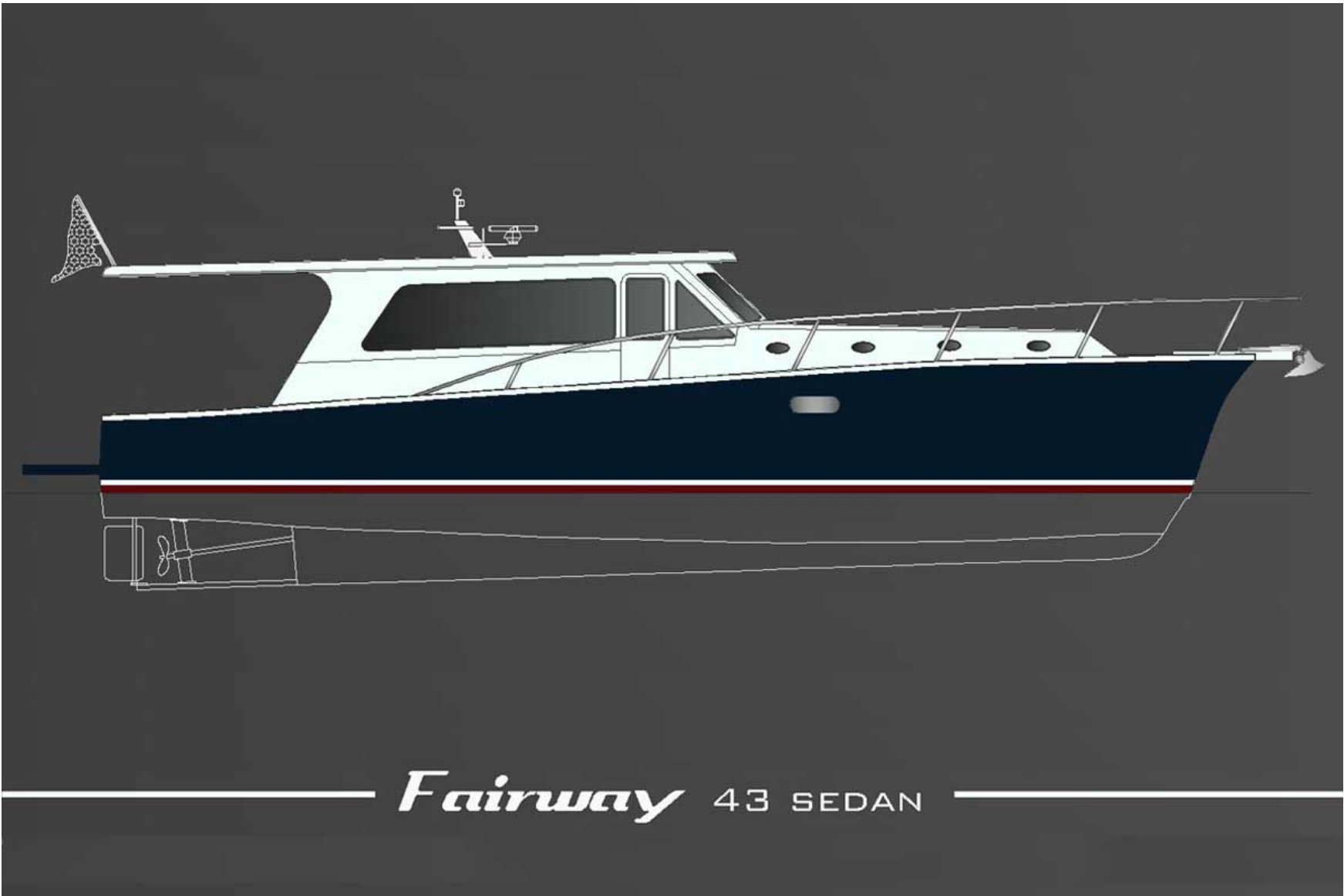
Fairway 43 SEDAN